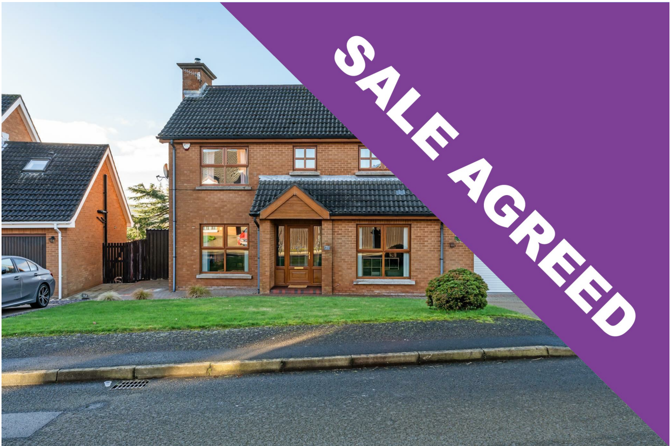
25 Glebe Manor, Newtownabbey, BT36 6HF